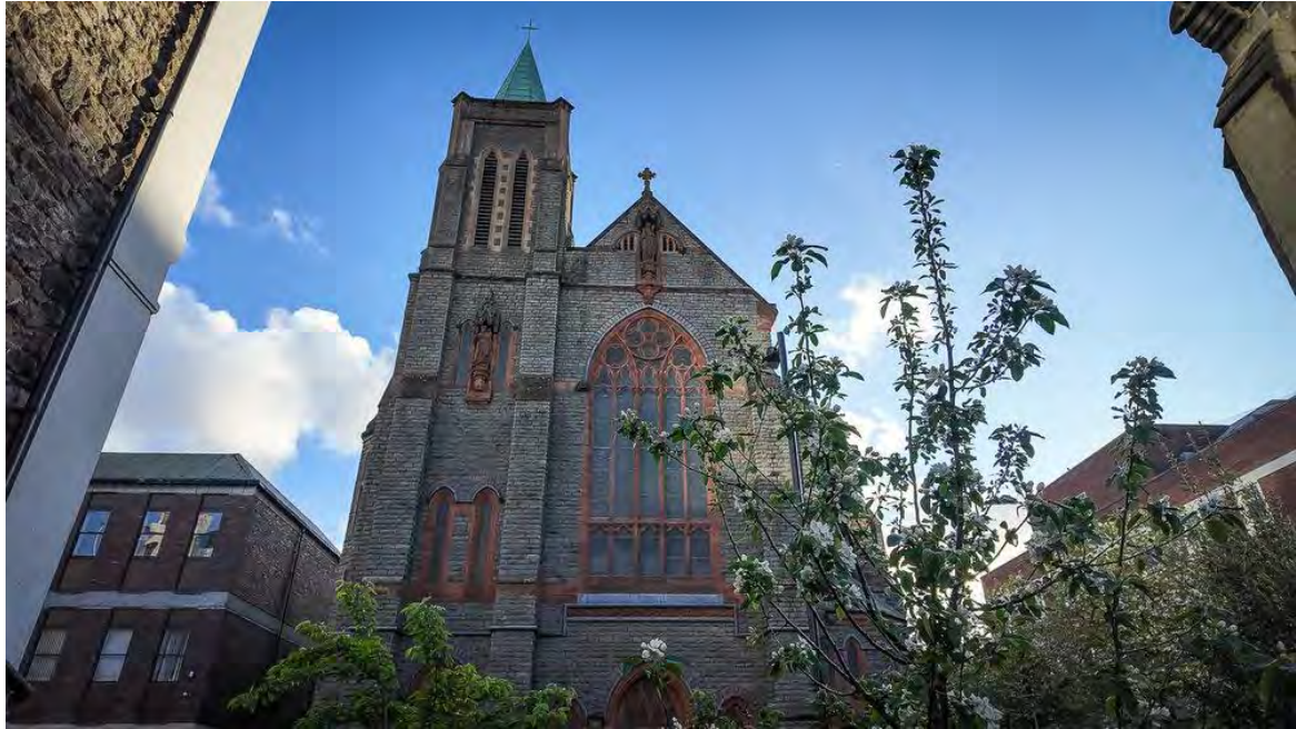
The Cardiff Metropolitan Cathedral of St David.

at Cardiff Metropolitan Cathedral of St David.