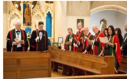
The Beadle Clerk and officers in the cathedral