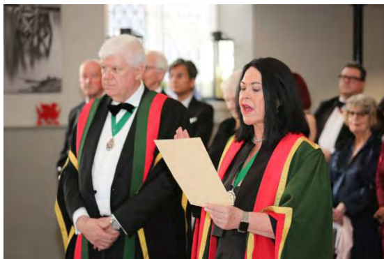
The Clerk with the New Master taking the Oath