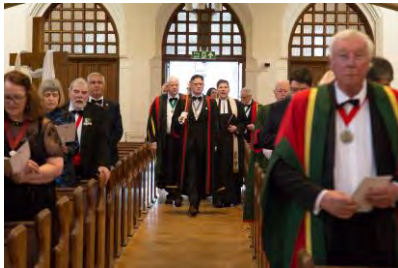
The Company processes down the nave of the Cathedral.