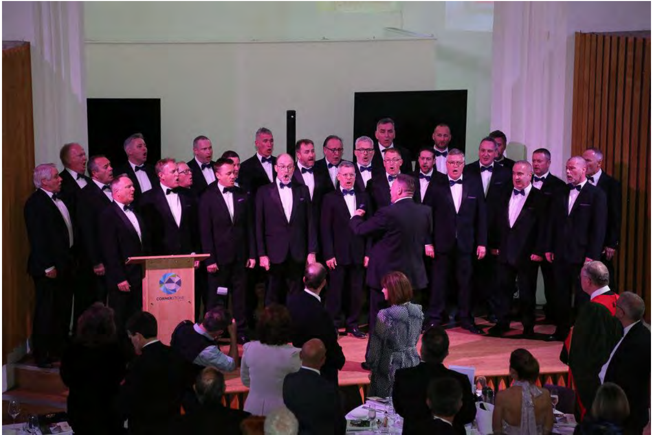
Côr Tadau Trisant, the Welsh male-voice choir, performing at the Banquet.