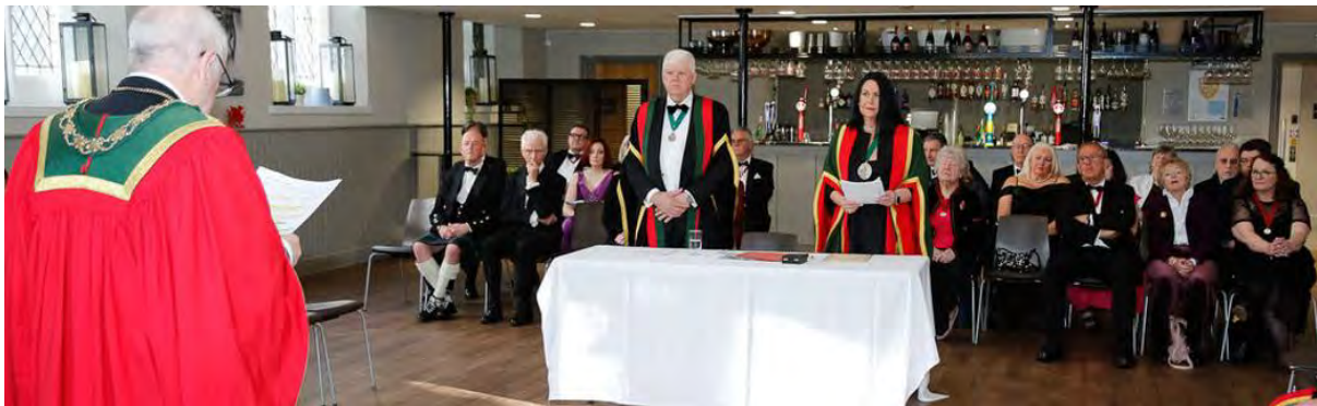
The Company assembled in the Jane Hodge Hall at the Cornerstone for the Installation Court