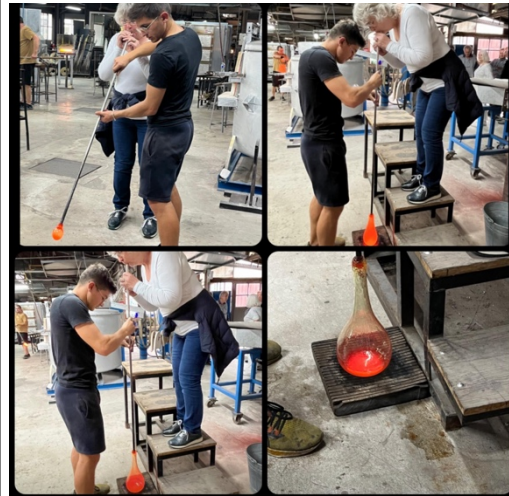
Learning how to blow glass