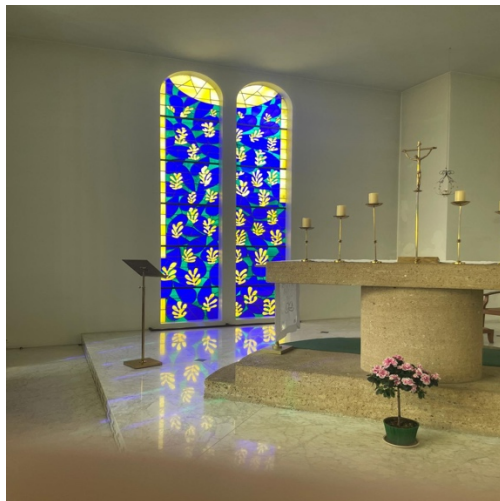
Visiting the Matisse Chapel