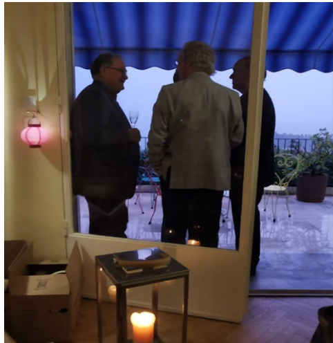
Champagne in Bel Epoque Villa overlooking Nice.