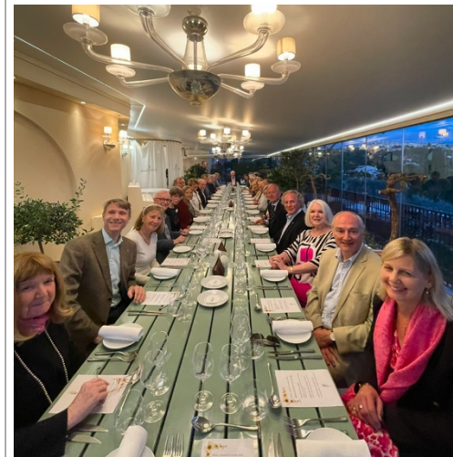
“Unmuteables” Michelin Star feast