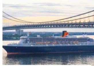
Queen Mary 2