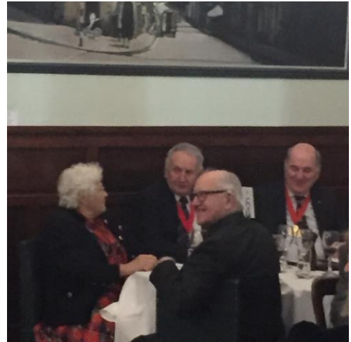
44 Liverymen and guests attended the superb three course dinner at the Cardiff & County Club, after the Carol Service