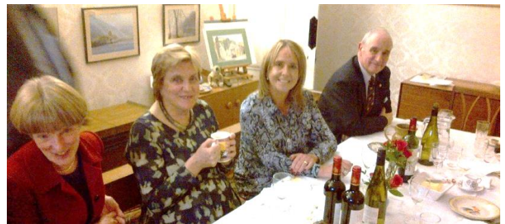
Liverymen enjoying the festivities after the service